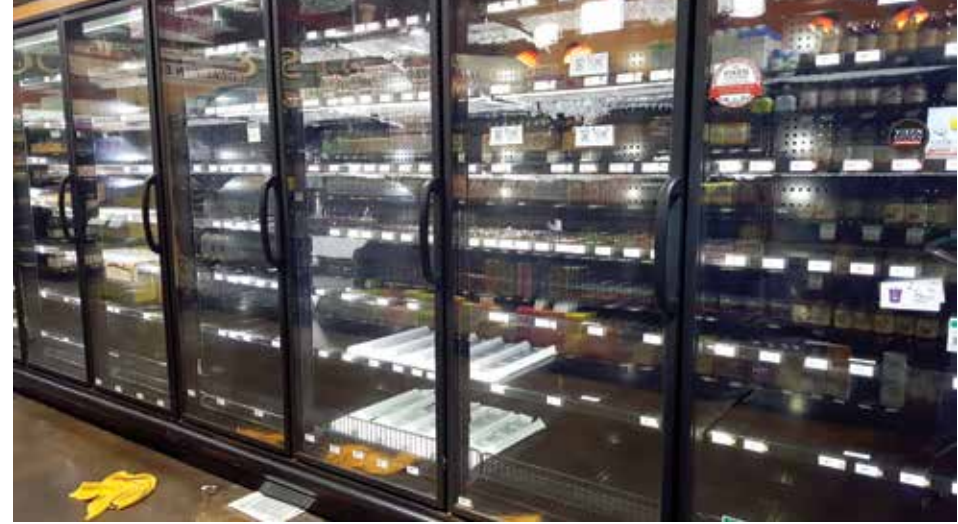
Bare shelves in the frozen department of North Coast Co-op's Eureka store during the refrigeration and freezer system failure.

Initially, we anticipated being without refrigeration in our Eureka store for two to four days, which would have been a huge inconvenience for shoppers stocking up for Memorial Day—and Kinetic Sculpture Race—weekend and a significant loss in sales. However, our Maintenance team had the issue resolved and the refrigeration running within 24 hours! Our staff worked cooperatively and diligently to get coolers and freezers restocked as quickly as