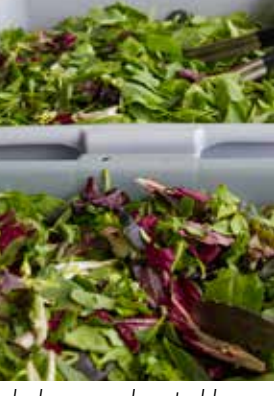
Salad greens donated by Earl's Organic Produce.